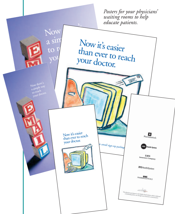
Posters for your physicians' waiting rooms to help educate patients.

As part of this initiative, HealthyEmail is providing two-year licenses of an award-winning email encryption program, ZixMail™, free of charge and without obligation to every physician in the United States and members of their office staff. Any doctor practicing in the U.S. can download the encryption software for themselves and two others in their office as well as print policy guidelines and educational materials established by HealthyEmail via the organization's Web site at www.healthyemail.org .